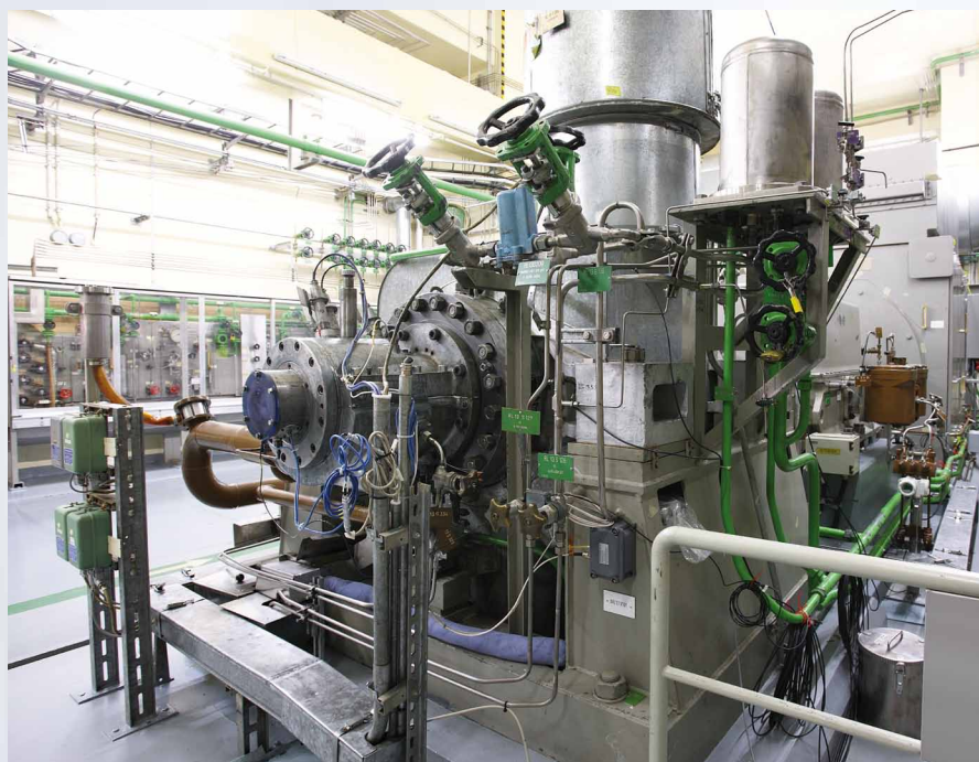
Boiler feed pump at the power station operator E.ON, equipped with EagleBurgmann DF-SAF(P)I.

Before the DiamondFaces® coating was used, it was tested under scientific conditions and with the original fluid as part of a project undertaken jointly by EagleBurgmann and the Technical University of Graz in Austria. After more than 10,000 hours of continuous operation without any signs of electrical corrosion on seal face or seat, it was then possible to go on to successful practical application of the seal solution together with E.ON.